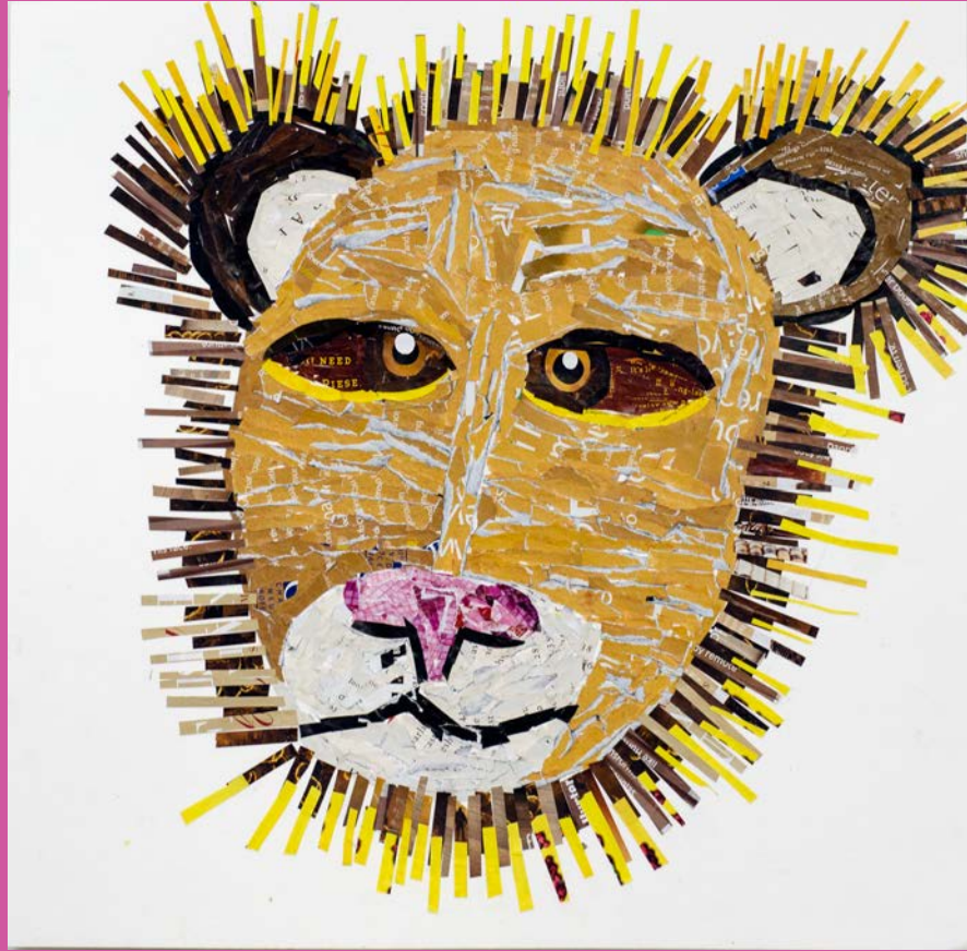
Collage by Christine Hammond

When you sign up for BEING Home, you'll receive regular emails from us with prompts to inspire you to make something new. During the video chats you can share these ideas on topics like landscape art, portraiture, art history, art from today, and more.