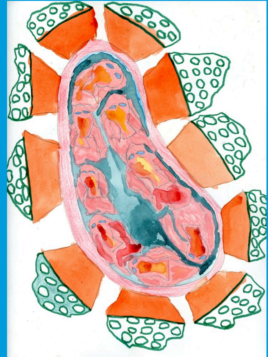
Abstract by Bing Cherry

You can find all this and more at www.beinghome.ca